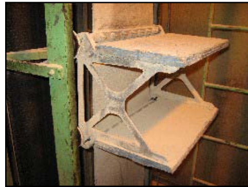
A close-up view of a platform step on the manlift shows the metal framework on the left and emergency ladder on the right.

The foreign-born worker in this incident and a friend were hired together by a temporary agency to work as cleaners at the feed processing plant. The men were both native Spanish speakers. They received on-the-job training at the plant from their supervisor in English. Although the Spanish-speaking cleaner had very limited proficiency in English, he had lived and worked in the USA for 30 years, and was comfortable managing tasks in an English-speaking environment. He had a physical impairment, a "slow" eye that impaired his ability to focus, which may have been a contributing factor in this incident.