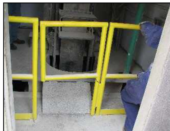
A gate guarded the manlift floor openings. At one opening, a raised plywood floor was spongy when walked upon, reducing secure footing.