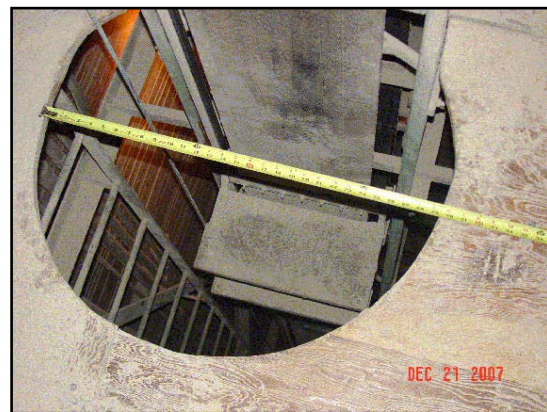
The victim fell through this manlift shaft opening. A platform step is shown on the lift belt, and the fixed ladder and stop cord at left.

Safety instructions on the belt and on the wall near the first-floor access shaft were in English only, and partially obscured due to wear. Although each floor was well lit, the environment was dusty and the shaft openings were unlit.