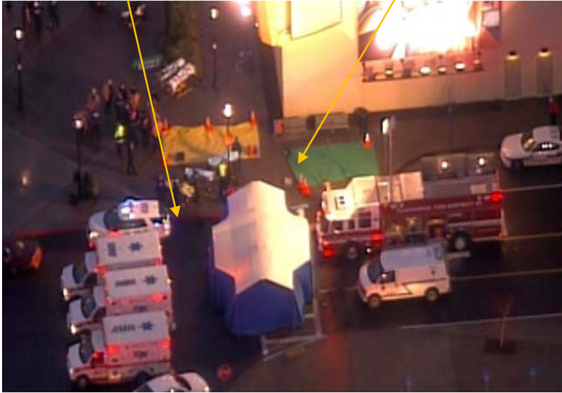
Casualty Collection Point