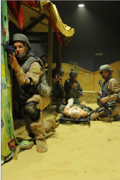
Victim Staging Area