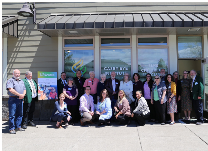
▲ Members of the Oregon State Elks Association visit the Elks Children's Eye Clinic in Bend, Ore.