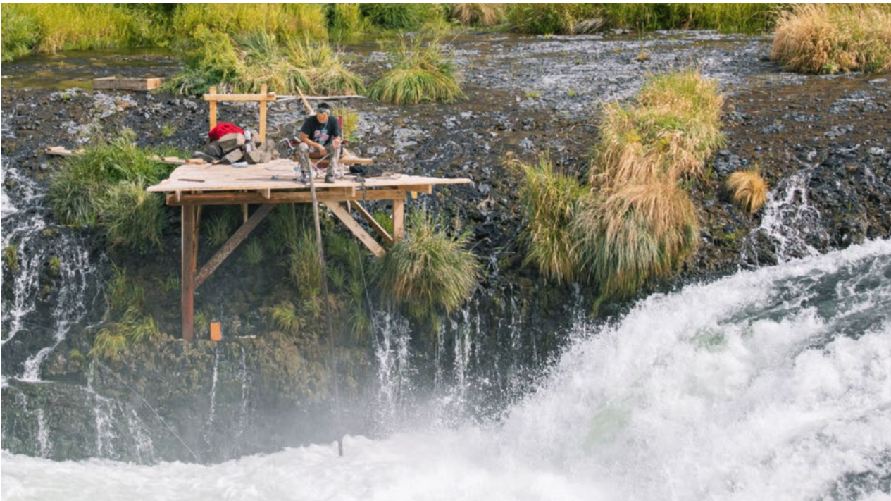
Sherars Falls on the Deschutes River

"More than 50 tribes fished wild rivers and great waterfalls, like the now submerged Celilo Falls on the mighty Columbia River. They scored petroglyphs in rock canyons like Picture Rock Pass and left behind the world's oldest pair of footwear at Fort Rock. Proud ancestors of those first people make up nine federally recognized tribes of Oregon: the Burns Paiute Tribe; the Confederated Tribes of Coos, Lower Umpqua and Siuslaw Indians; the Coquille Indian Tribe; the Cow Creek Band of Umpqua Tribe of Indians; the Confederated Tribes of Grand Ronde; the Klamath Tribes; the Confederated Tribes of Siletz; the Confederated Tribes of the Umatilla Indian Reservation; and the Confederated Tribes of Warm Springs." Travel Oregon. Read more about Oregon Tribes.