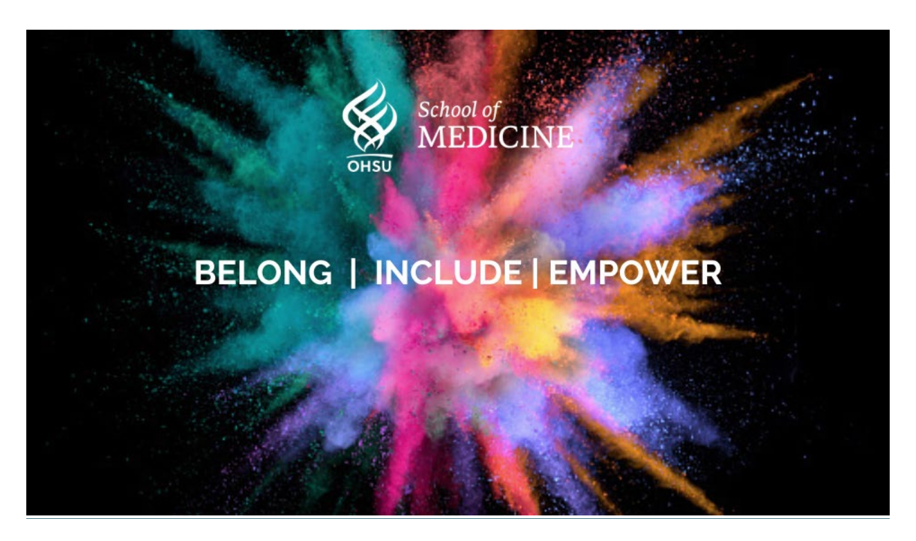
School of Medicine's "Belong, Include, Empower" - December 2024